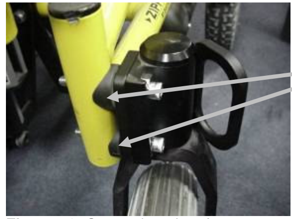
Figure 10: Setup placed on frame

Notice the saddles flush against the frame.