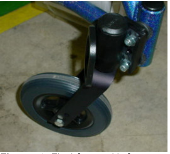
Figure 13: Final Setup with Caster Barrel Trailing

922973 REV. B September, 2007 Page 5 of 8