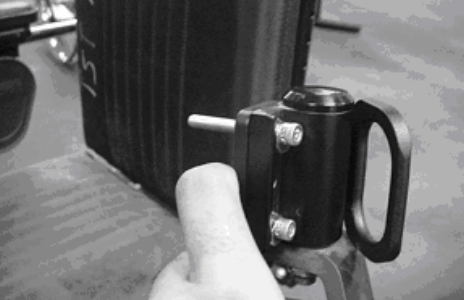
Figure 9: Bracket attached to wheel mount

4. Now the front transit bracket must be placed on the setup from step 3. The bracket should be placed so that the transit bracket is facing toward the rear of the chair but the caster barrel can be leading (facing forward) or trailing (facing rearward) the caster barrel should be reassembled the same way it was oriented in step 1. This setup can be seen in Figure 9 . (Note: The caster barrel is depicted in the trailing position in Figure 9 ).