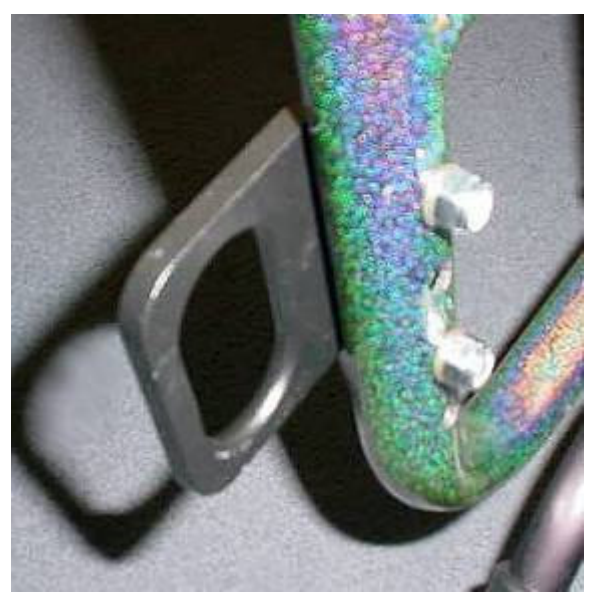
Figure 6: Folding Frame Assembly

922973 REV. B September, 2007 Page 7 of 8