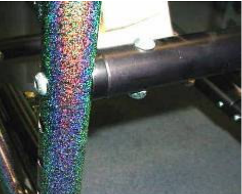
Figure 4: Rear Strut Tube & Hardware

3. This step is for rigid frames only. Using the 5/32" Allen wrench remove the hardware that attaches the rear strut tube to the side frame. The Rear Strut Tube and Hardware can be seen in Figure 4 .