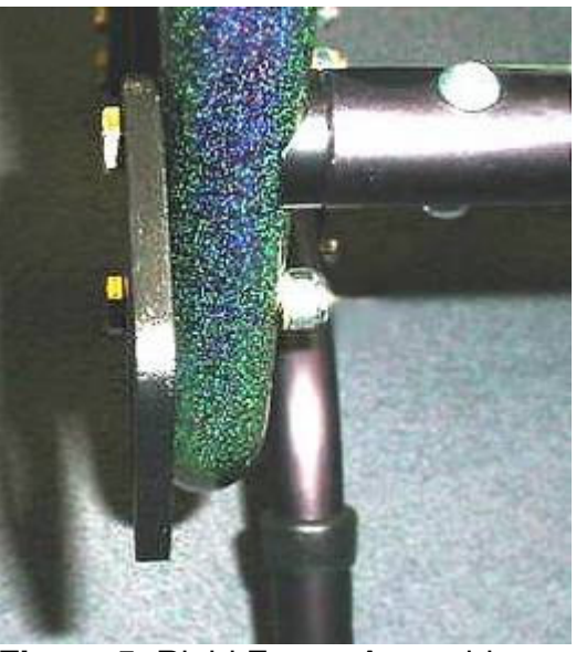
Figure 5: Rigid Frame Assembly

4. Next insert the assembly created in step 2 into the side frame by inserting the hardware from the outside of the chair into the top hole in the side frame. The rear transit bracket should be oriented so that the bracket extends out the rear of the chair (view Figure 6 for reference). When doing this if it is a Rigid Frame the top hardware will insert into the rear strut tube and place a ¼" washer and ¼-28 Nylock Nut on the exposed Bolt (The final assembly can be seen in Figure 5 ). If it is a Folding frame place one ¼" washer on each bolt, and place one ¼-28 Nylock Nut on each bolt (The final assembly can be seen in Figure 6 ). The bolts and nuts must be tightened to 8-9ft-lbs of torque.