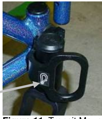
Figure 11: Transit Mount Location Decal Placement

922973 REV. B September, 2007 Page 4 of 8