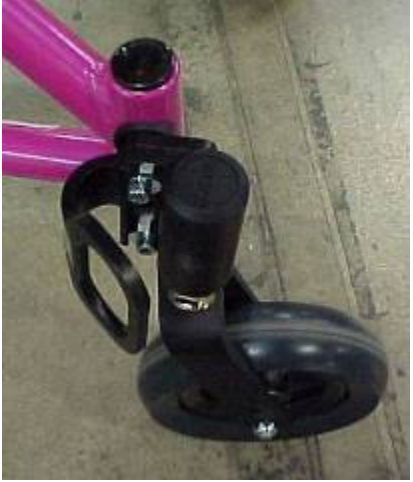
Figure 12: Final Setup with Caster Barrel Leading

7. Do steps 1-6 again for the other front wheel. The final setup should look like Figure 12 or Figure 13 located on the next page.